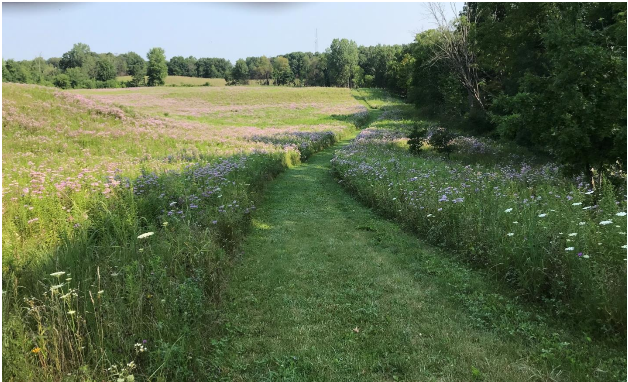
August - Just over the hill on the entrance path. The picture does not capture the scene adequately.