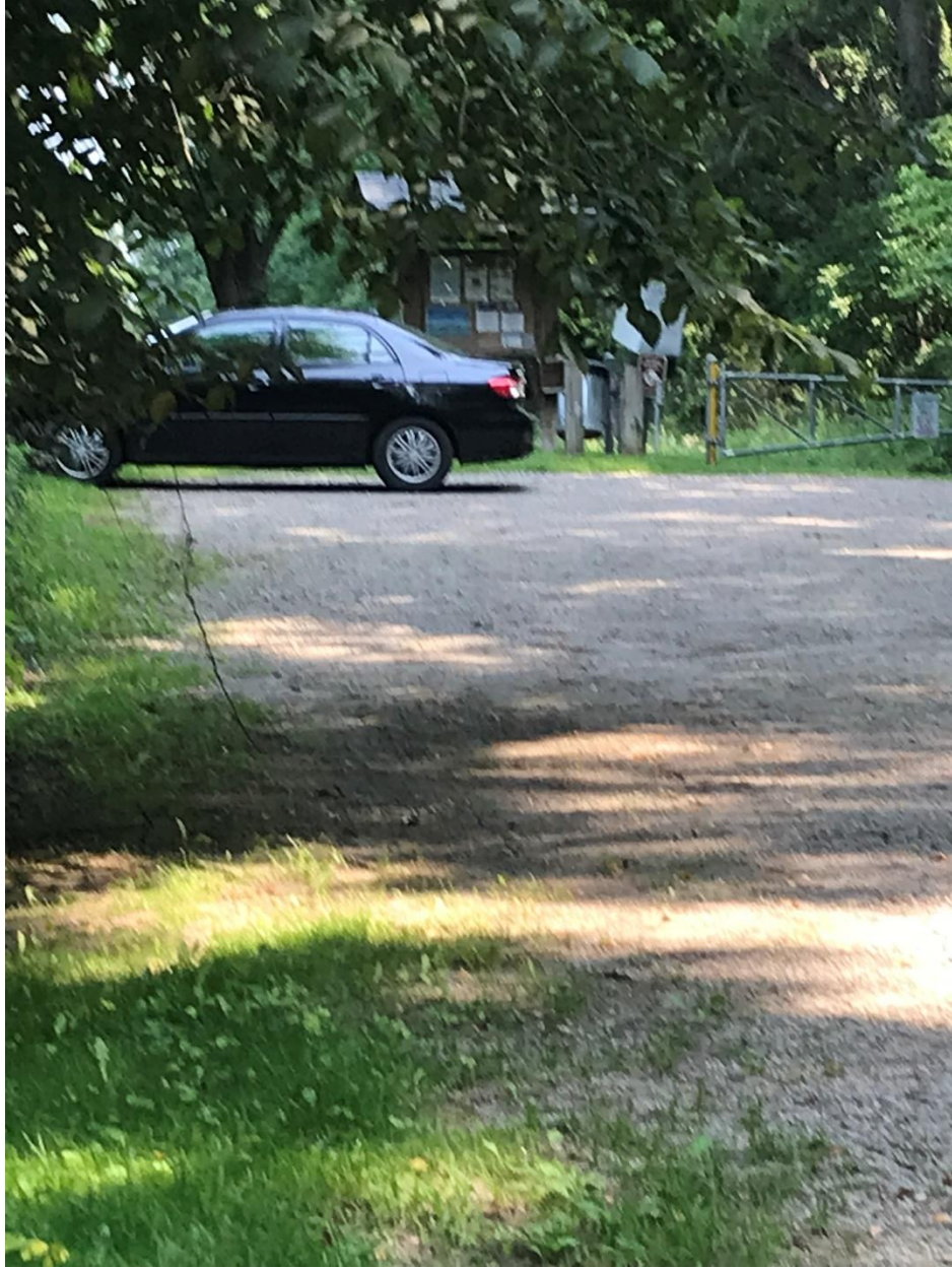
Small parking lot at the entrance. Not too crowded today – just me.