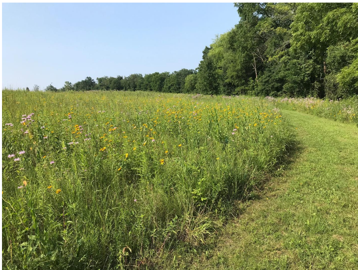
A path in the middle of the park